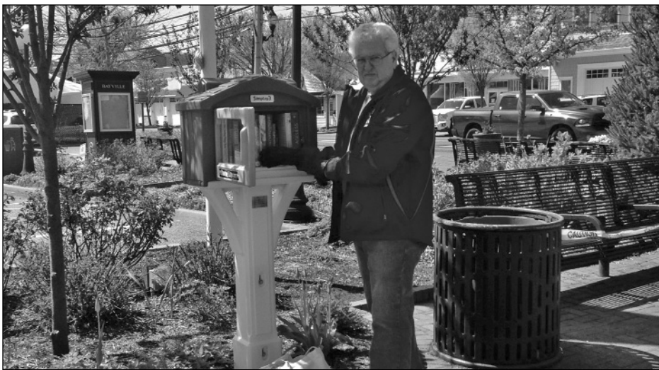
One of the several "lending libraries" in Bayville.