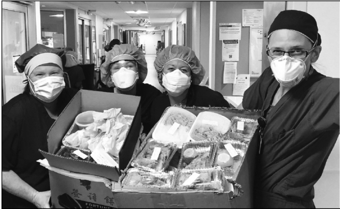
Much appreciated meals were delivered.

London Jewelers is proud to announce its #LondonJewelersCares initiative, delivering meals to the courageous staff at North Shore University Hospital, Glen Cove Hospital, LIJ Medical Center, Mount Sinai Hospital, and NYU Medical Center.