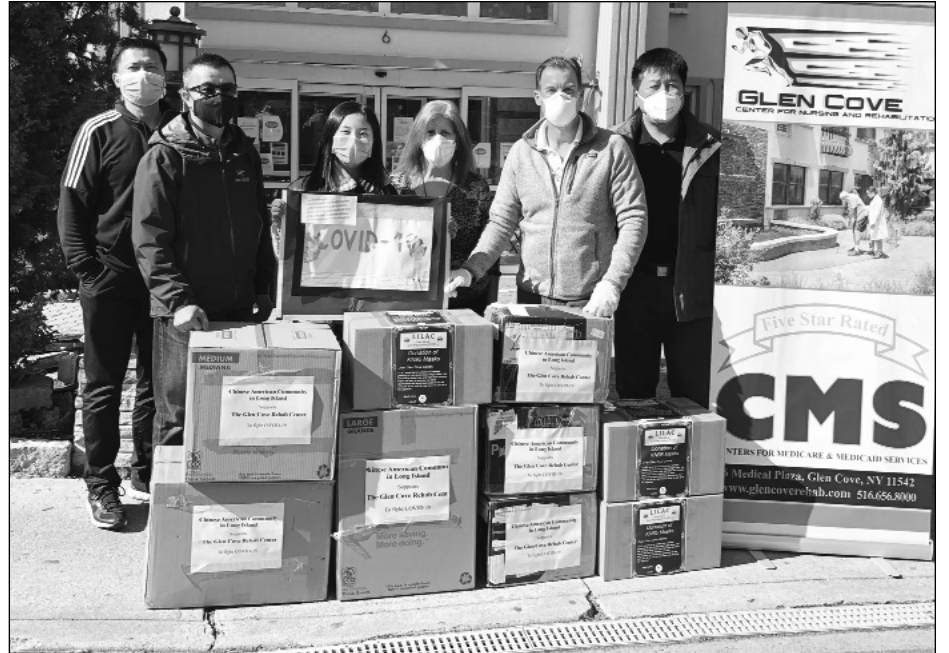
Suozzi will survey all senior facilities regarding need in District. Last week delivered 2,500 N95 masks to both Glen Cove and Huntington Hospitals

Today, Congressman Tom Suozzi (D-Long Island, Queens) and two nonprofit Chinese American organizations, working together, delivered more than 1,000 pieces of personal protective equipment (PPE) to the Glen Cove Center for Nursing and Rehabilitation to assist the center’s staff as they help stop the spread of COVID-19. The donation consisted of protective coverall gowns (75 pieces), goggles (150 pieces), face shields (150 pieces), disposable hats (300 pieces), and N95 face masks (500 pieces).