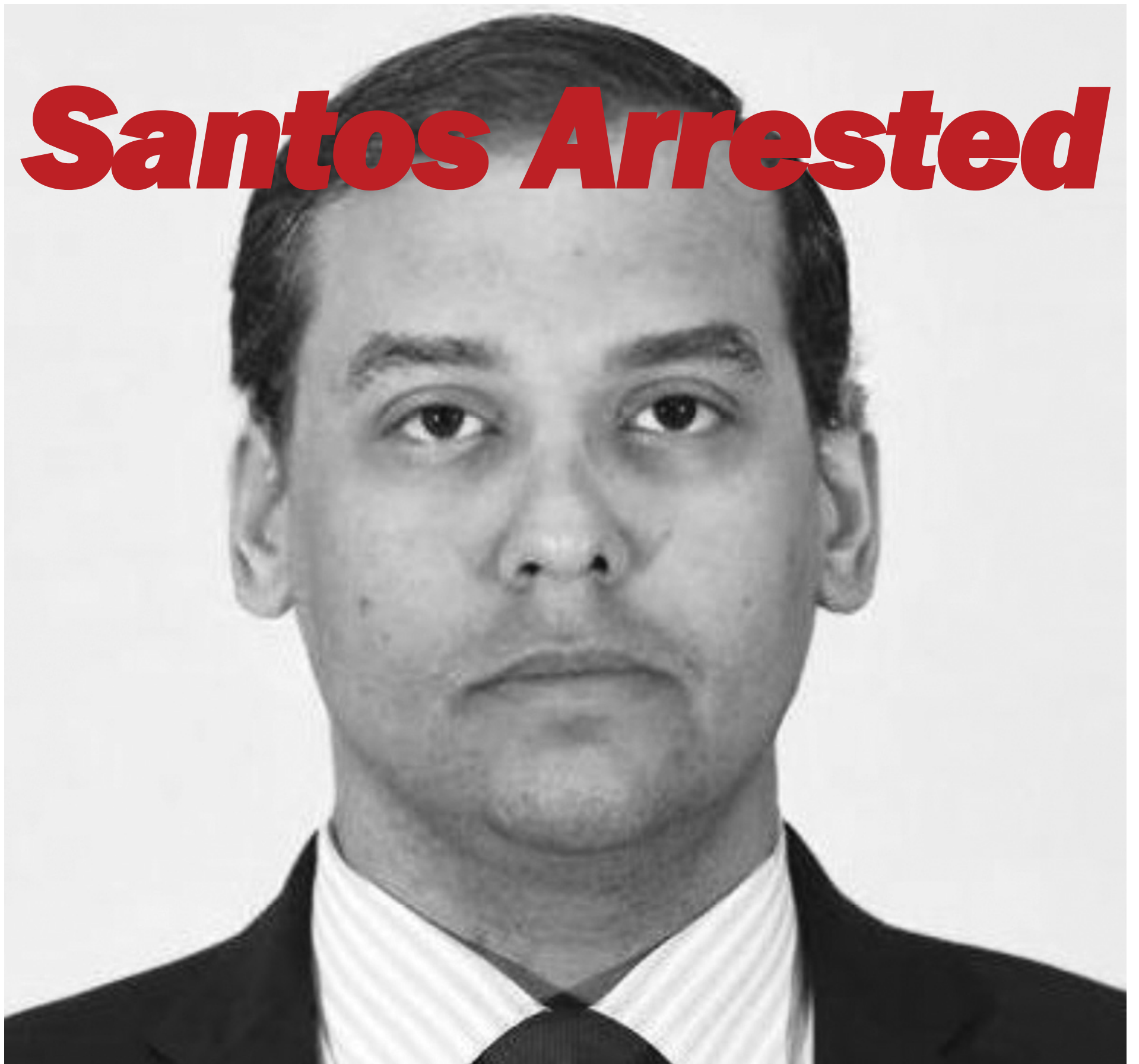
US Congressman George Santos. Story on page 3.