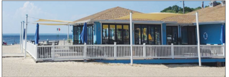
The former Blu Iguana on Tappan Beach