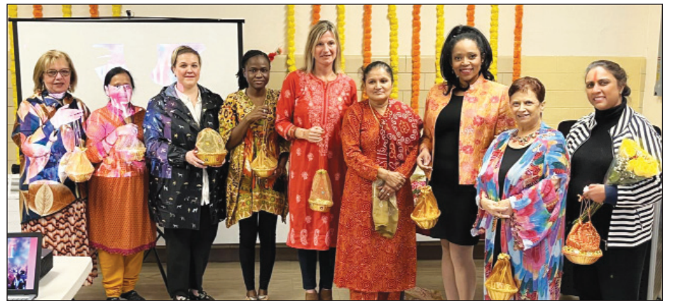
Some of the crowd celebrating the Indian spring festival of Holi-Paghwah