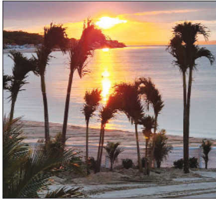
A beautiful sunset on the Long Island Sound.

Ladies Night Out at the Crescent Beach Club was a great success for the Boys & Girls Club of Oyster Bay/East Norwich Bahnik Youth Center. There were thirteen Boutique vendors featuring