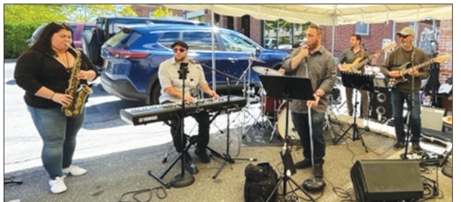
The Band Face to Face entertained the crowd.

Stop by the deli their service and food never disappoints.