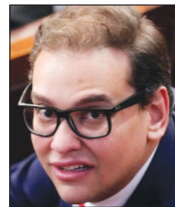
George Devolder Santos

"He needs to go away," stated US Congressman Nick LaLota (R-Huntington) from the neighboring 1st district, who has called upon the US House to expel Santos. "I want to concentrate on important things like the border, China and debt. He is a complete embarrassment."