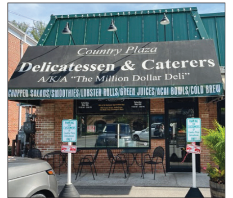
The "Million Dollar Deli"