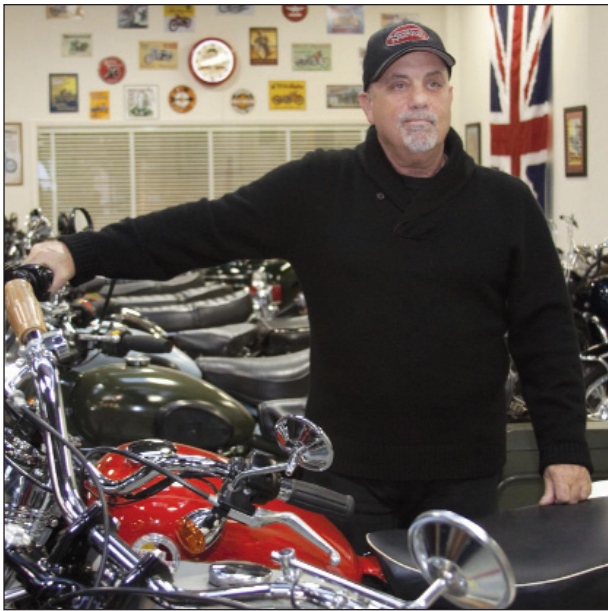
Billy Joel at his 20th Century Cycles shop.