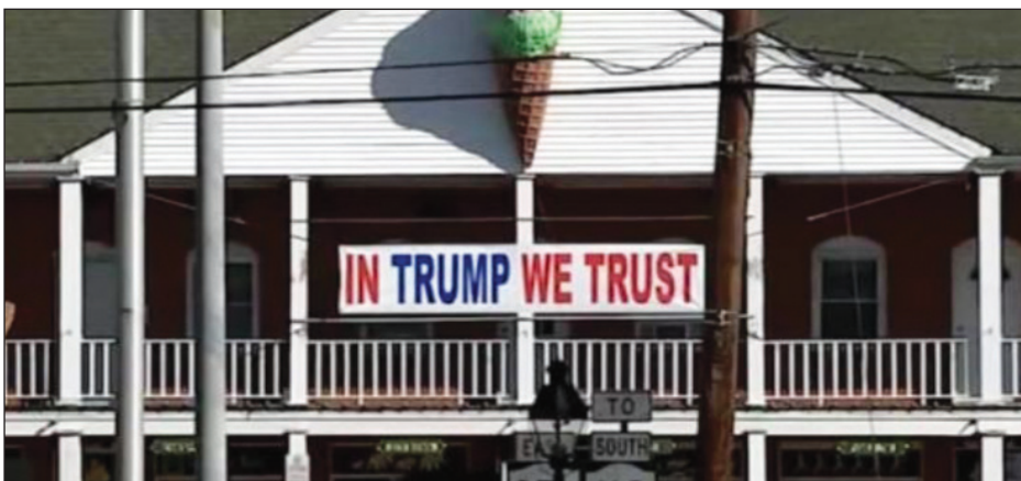
Roger's Frigate ice cream store.

Roger's Frigate ice cream store has removed a pro-Trump sign from the front of its shop building after being ordered to do so by Port Jefferson Village officials.