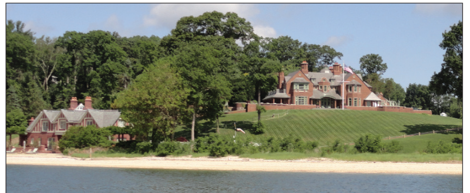
Billy Joel's home on Centre Island.

Although the pro-enforcement side appeared to win in Port Jefferson, Friday brought a more significant defeat for Trump opponents. The decision of Republicans to oppose calling witnesses in the Senate Trial ends the Democrat's last best hope for impeachment and renders the remaining portions of the impeachment proceedings likely to be a mere formality ending in acquittal.