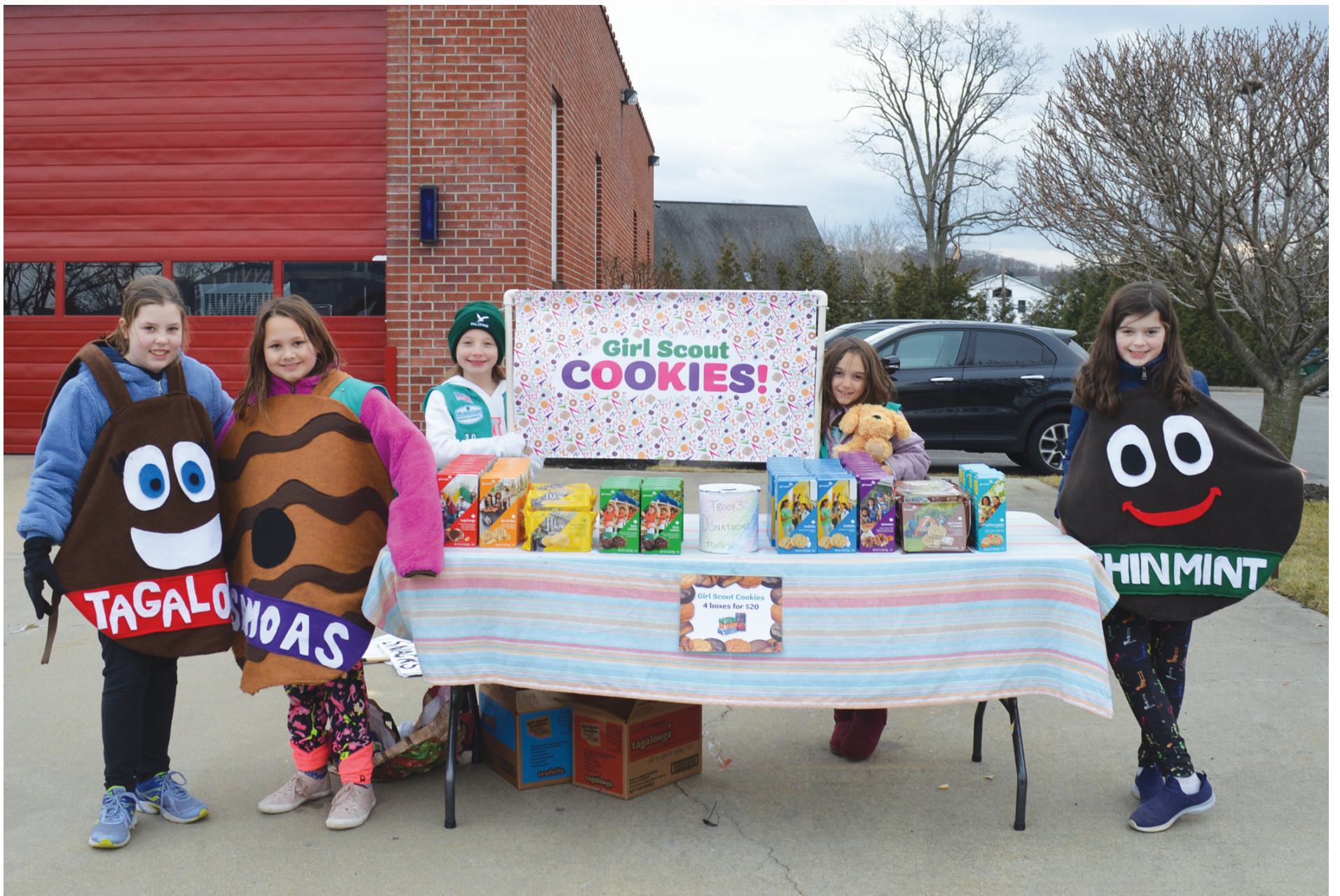
The month of February kicks off the Annual Girl Scout's cookie fundraiser. Bayville Troop 30 was very busy selling cookies this past Sunday in front of the Bayville Fire Department.