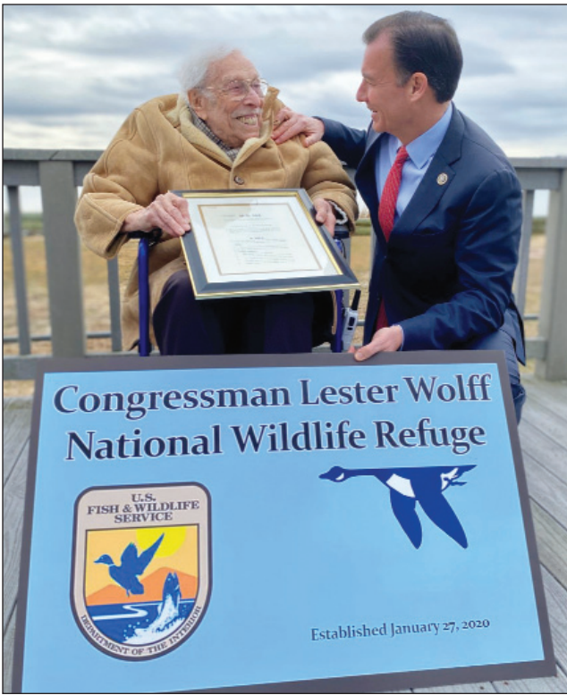
Lester Wolff and Tom Suozzi.

On Friday, Third District Congressman Tom Suozzi announced the official renaming of the Oyster Bay National Wildlife Refuge to the Congressman Lester Wolff National Wildlife Refuge. Congressman Lester Wolff is the oldest living former member of Congress, at 101, and was instrumental in the creation of the federal refuge in 1968.